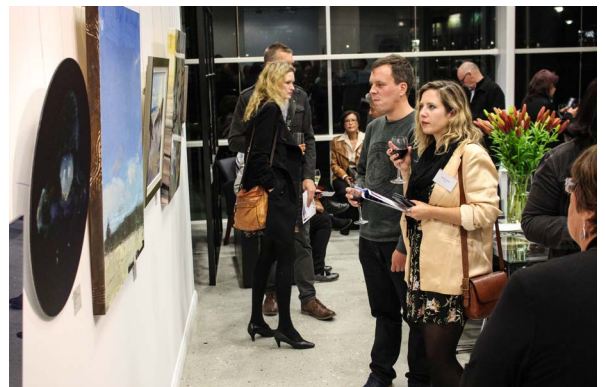
Art Award Opening Event

Sales: 3 sales, $398 made in commission.