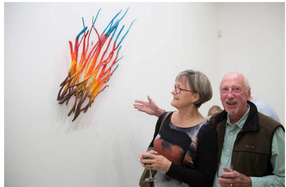
At the Artonomy Opening Event.

"Incredibly fun concept, executed wonderfully"