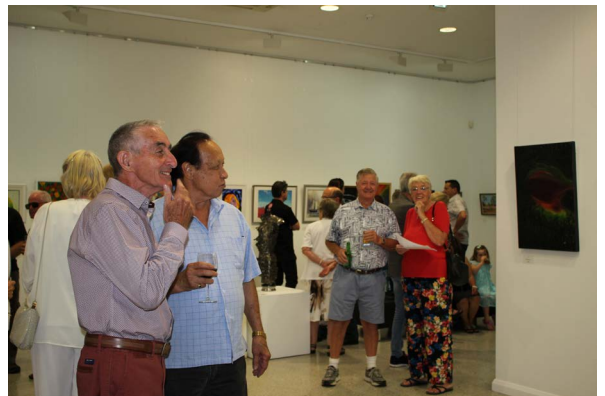
Colour My World Opening Event

Sales: 3 individual artworks were sold to the value of $400, however commission is not charged for this exhibition.