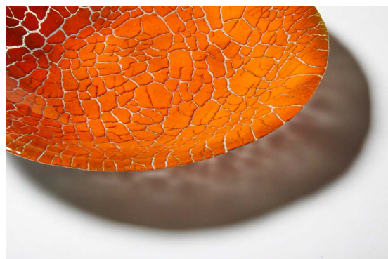
Jill Yelland - Cracked Earth (detail)