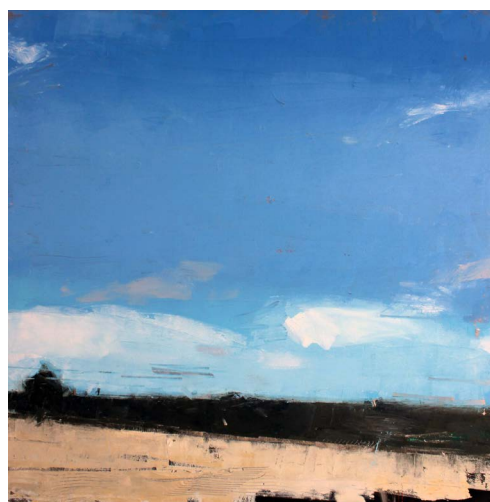
Ric Burkitt - Scrub Line