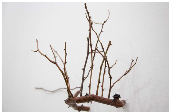
Bev Isles, Untitled , 2018