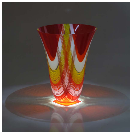
Anne Sorensen - Morning Light

"Beautiful creations – so much in touch with nature" 18/8/18